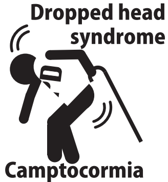
Dropped head syndrome