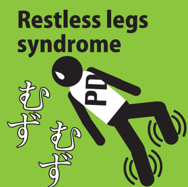
Restless legs syndrome